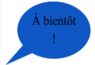
– Alain BASHUNG (musicien français)